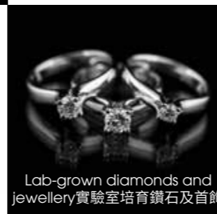
Lab-grown diamonds and jewellery 實驗室培育鑽石及首飾