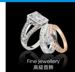
Fine jewellery 高級首飾