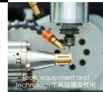
Tools, equipment and technology 工具設備及技術