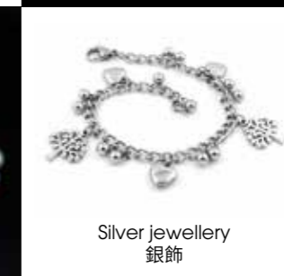
Silver jewellery 銀飾