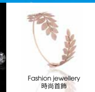
Fashion jewellery 時尚首飾