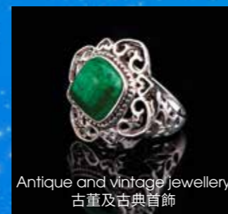
Antique and vintage jewellery 古董及古典首飾

To make the fair easier to navigate and thus enhance business matching, JGA's quality exhibitors are grouped according to the products they offer. 展覽廳根據參展商的产品類別劃分為不同展區, 讓買家更迅速地鎖定心儀產品, 提升洽商機, 促成交易。