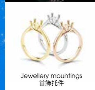
Jewellery mountings 首飾托件