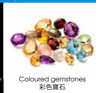
Coloured gemstones 彩色寶石