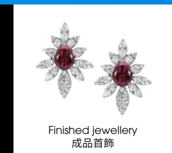
Finished jewellery 成品首飾